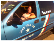
By: Ann Darbonne Lone Star Cab 53

As you all know by now we received a raise of $ .10 cents on the drop at the end of December 2010 for our cleanup fee request. We also got a minimum out of the airport for the amount of $11.95 (including the $1.00 surcharge). Although this is not the goal that the TDAA aimed for, it is still a victory. It is something we now have that we did not have before.