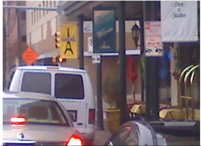
Here, an illegally parked, J & G Van, causes a traffic jam in front of the Hampton Inn!